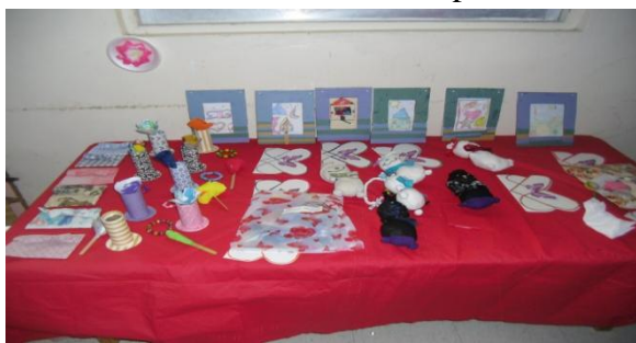
Handy craft made by the Summer Campers

CONGRATULATIONS my dear children on your achievements of preschool education and the summer campers