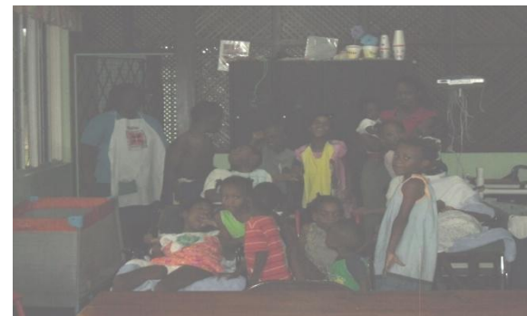
The St. Benedict Children's Home residents

In recent times (2011 - 2016) Our admission grew in a flash, within one week we admitted six (6) children in dire need of care (2 brothers each of two different families), one brother, one sister. This has pushed the number up to 20 children. To date the number remains high at 18 children