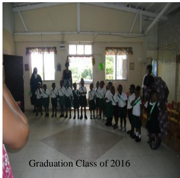
Graduation Class of 2016