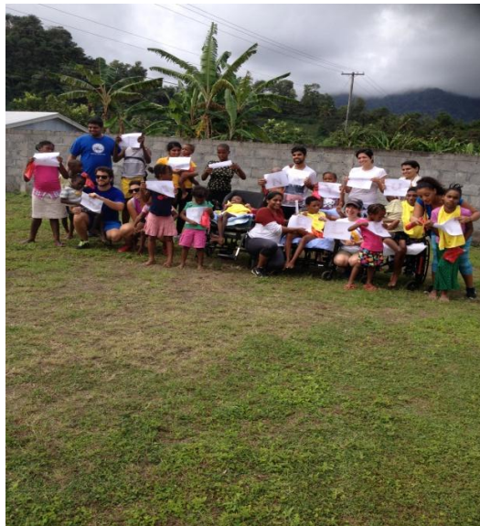
Medical Students and Children

Many visitors, took time off to visit the children - They enjoyed games in St. Benedict Park, adopting a child for the duration of the visit, shared snacks - to the children's delight. Many of the medical students and groups engaged the children in art and craft, tie dying, socialization. We thank them sincerely for their kind assistance. We are already looking forward to further assistance as Christmas is fast approaching.